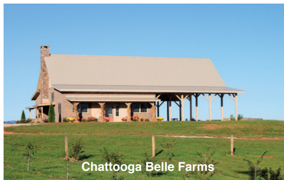
Chattooga Belle Farms