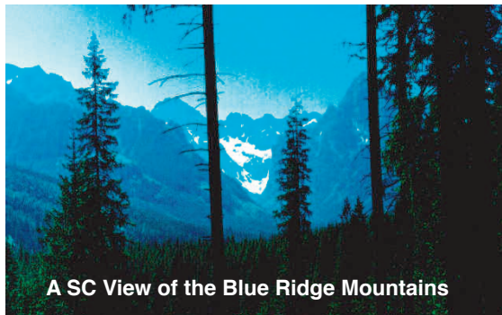
A SC View of the Blue Ridge Mountains