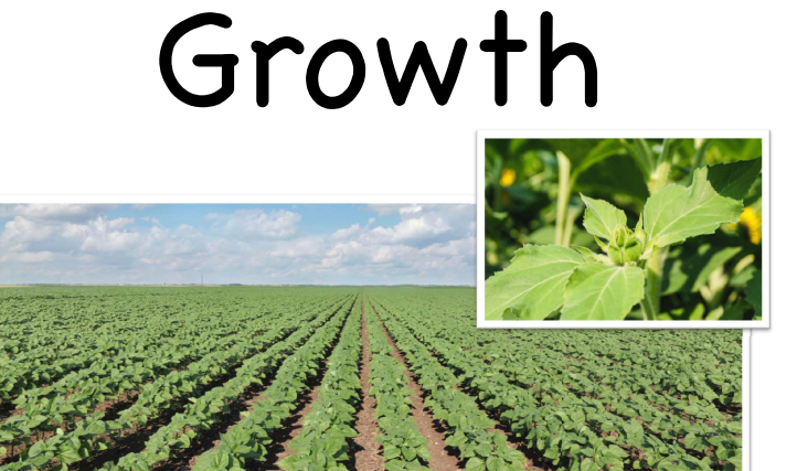
Sunflowers grow a very tall stem and leaves.