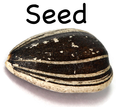
Sunflower seeds are usually black with white stripes