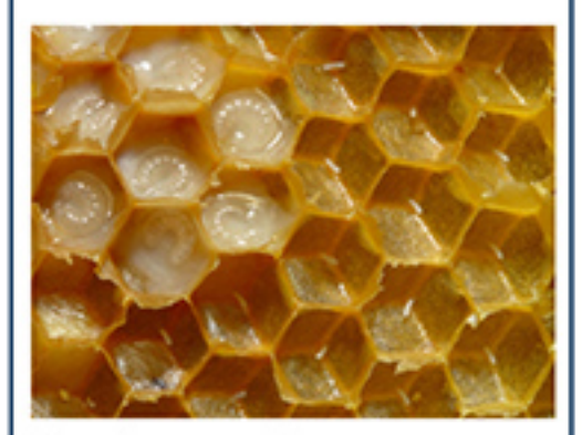
Honey bee eggs and larvae