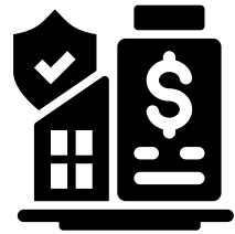
Finance & Insurance