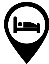
Travel & Leisure