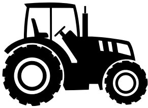
Farm & Lawn Equipment