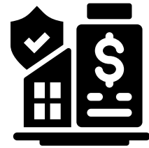
Finance & Insurance