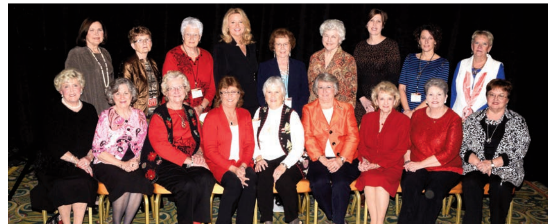
At the 2015 SCFB Convention Awards Program, eighteen County Women's Chairs received the Women's Committee Activity Award. Shown above are Women's Committee Chairs from: Anderson, Beaufort, Calhoun, Chesterfield, Dorchester, Edgefield, Florence, Georgetown, Greenville, Jasper, Laurens, Lexington, Newberry, Oconee, Orangeburg, Saluda, Sumter and York. Congratulations!!